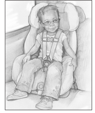
Figure 5. Forward-facing car safety seat with a harness.

4. Travel vests —Vests can be worn by children 22 to 168 pounds and can be an option to traditional forward-facing seats. They are useful for when a vehicle has lap-only seat belts in the rear, for children with certain special needs, or for children whose weight has exceeded that allowed by car safety seats. These vests usually require use of a top tether.