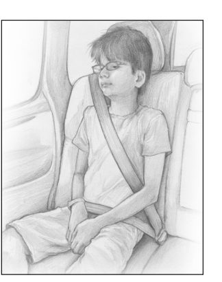
Figure 7. Lap and shoulder seat belts.

Consider buying another car with lap and shoulder belts in the back seat.