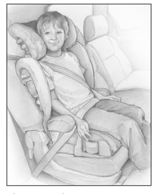
Figure 6. Belt-positioning booster seat.

facing limit for their car safety seat should use a belt-positioning booster seat until the vehicle seat belt fits properly, typically when they have reached 4 feet 9 inches in height and are 8 to 12 years of age. Most children will not fit in most vehicle seat belts without a booster until 10 to 12 years of age. All children younger than 13 years should ride in the back seat. Instructions that come with your car safety seat will tell you the height and weight limits for the seat. As a general guideline, a child has outgrown a forward-facing seat when any of the following situations is true: