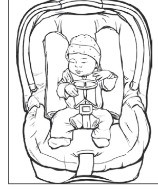
Figure 4. Car safety seat with a small cloth between the crotch strap and infant; chest clip positioned at the center of the chest, even with the infant's armpits; and tightly rolled receiving blankets on both sides of the infant.

A: You can try placing a tightly rolled receiving blanket on both sides of your child. Many manufacturers allow the use of a tightly rolled small diaper or cloth between the crotch strap and your child, if necessary, to prevent