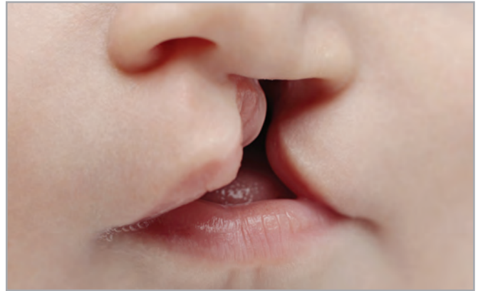
Baby with cleft lip

consultant can help parents obtain and use a breast pump. This condition can also cause nasal regurgitation (breast milk or infant formula that comes out of the nose). Most babies with cleft palates will swallow a great deal of air and require frequent burping. Rarely, special appliances called obtulators (a prosthetic device that closes the opening of the cleft) are required. To babies who are developmentally ready, age-appropriate solid foods can be offered. This may also be associated with nasal regurgitation that is seldom a problem. Young children who are ready to drink from a cup may do so, but they may be more successful with an open cup, rather than a sippy cup. The cleft or craniofacial team caring for the child can give advice on feeding.