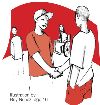
Illustration by Billy Nuñez, age 16