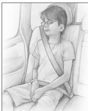
Figure 7. Lap and shoulder seat belts.