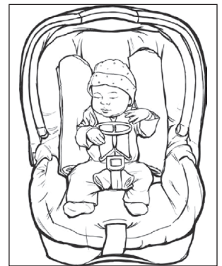
Figure 4. Car safety seat with a small cloth between the crotch strap and infant; chest clip positioned at the center of the chest, even with the infant's armpits; and tightly rolled receiving blankets on both sides of the infant.

A: Bulky clothing, including winter coats and snowsuits, can compress in a crash and leave the straps too loose to restrain your child, leading to increased risk of injury. Ideally, dress your baby in thinner layers and wrap a coat or blanket around your baby over the buckled harness straps if needed.