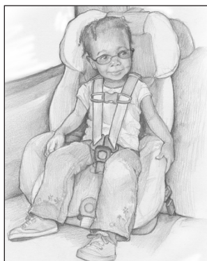
Figure 5. Forward-facing car safety seat with a harness.

4. Travel vests —Vests can be worn by children 22 to 168 pounds and can be an option to traditional forward-facing seats. They are useful for when a vehicle has lap-only seat belts in the rear, for children with certain special needs, or for children whose weight has exceeded that allowed by car safety seats. These vests usually require use of a top tether.