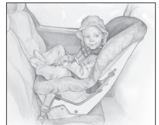
Figure 3. Convertible car safety seat used rear facing.