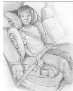
Figure 6. Belt-positioning booster seat.

Booster seats are for older children who have outgrown their forward-facing seats. All children whose weight or height exceeds the forward-facing limit for their car safety seat should use a belt-positioning booster seat until the vehicle seat belt fits properly, typically when they have reached 4 feet 9 inches in height and are 8 to 12 years of age. Most children will not fit in most vehicle seat belts without a booster until 10 to 12 years of age. All children younger than 13 years should ride in the back seat. Instructions that come with your car safety seat will tell you the height and weight limits for the seat. As a general guideline, a child has outgrown a forward-facing seat when any of the following situations is true: