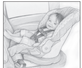
Figure 2. Rear-facing-only car safety seat.