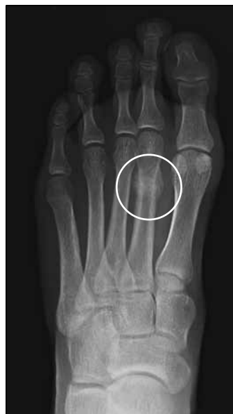
Figure 1. X-ray showing stress fracture in second metatarsal.

To confirm the presence of a stress fracture, your doctor may need to order an x-ray (see Figure 1). If the x-ray does not show a stress fracture, a bone scan (see Figure 2) or magnetic resonance imaging (MRI) may be needed.