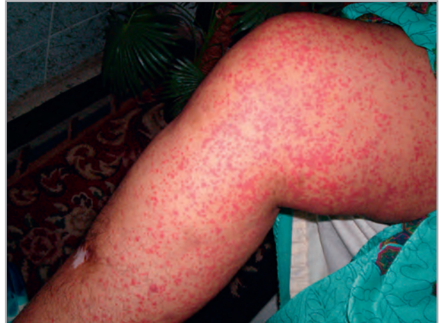
Child with purpura