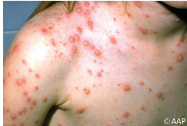
Child with chickenpox rash